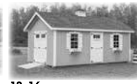
12x16 Elite Utility $7,380