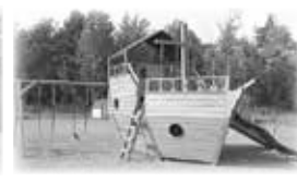
Small Boat w/ accessories $4,048