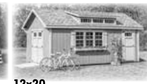
12x20 Elite Dormer $9,950

Many Sizes, Styles, Options & Colors. Built Locally. Prices Subject to Change. Pictures May Not Reflect Current Inventory. Not responsible for typographical errors.