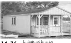
14x36 ADK Cabin $12,705