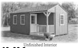
12x20 Cozy Cottage $7,935