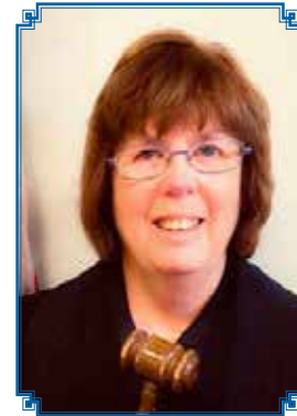
TOWN OF MALONE

for TOWN JUSTICE Election Day Nov. 2, 2021