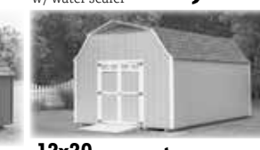
12x20 High Barn $6,150