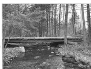
Loggers, forest landowners, town and zoning officials are encouraged to attend!

Continuing Education Credits available through: • Society of American Foresters-4.5 • Master Logger Training - 6hrs • New York Logger Training - 1 **Pending approval