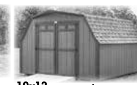
10x12 Mini Barn $3,315