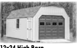
12x24 High Barn Carriage Shed $8,230