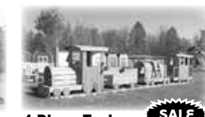
4 Piece Train Set w/ water sealer $3,300