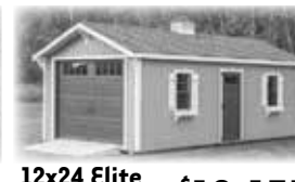
12x24 Elite Carriage Shed $10,155