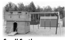
Small Castle w/ accessories $2,739