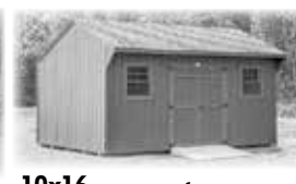
10x16 Quaker $5,170