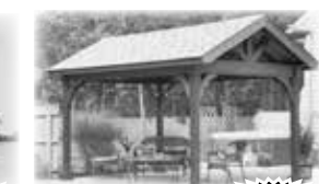
12x16 A-Frame Pavilion Kit $6,302