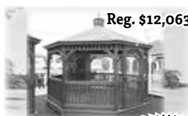
14' Wood Octagon w/ stain, screens, and screen floor $10,090