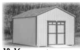
12x16 Cottage $5,250