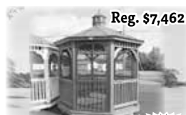
10' Octagon w/ stain, screens, screen floor and cupola $6,095