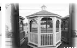
10' Vinyl Octagon w/ screens, screen floor & cupola $6,905