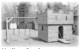
Medium Castle w/ accessories $3,650