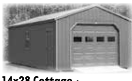
14x28 Cottage Carriage Shed $10,360