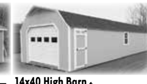
14x40 High Barn Carriage Shed $13,620